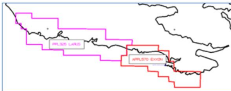
Figure 2: ExxonMobil exploration license applications (red), Larus' PPL326 license (pink)